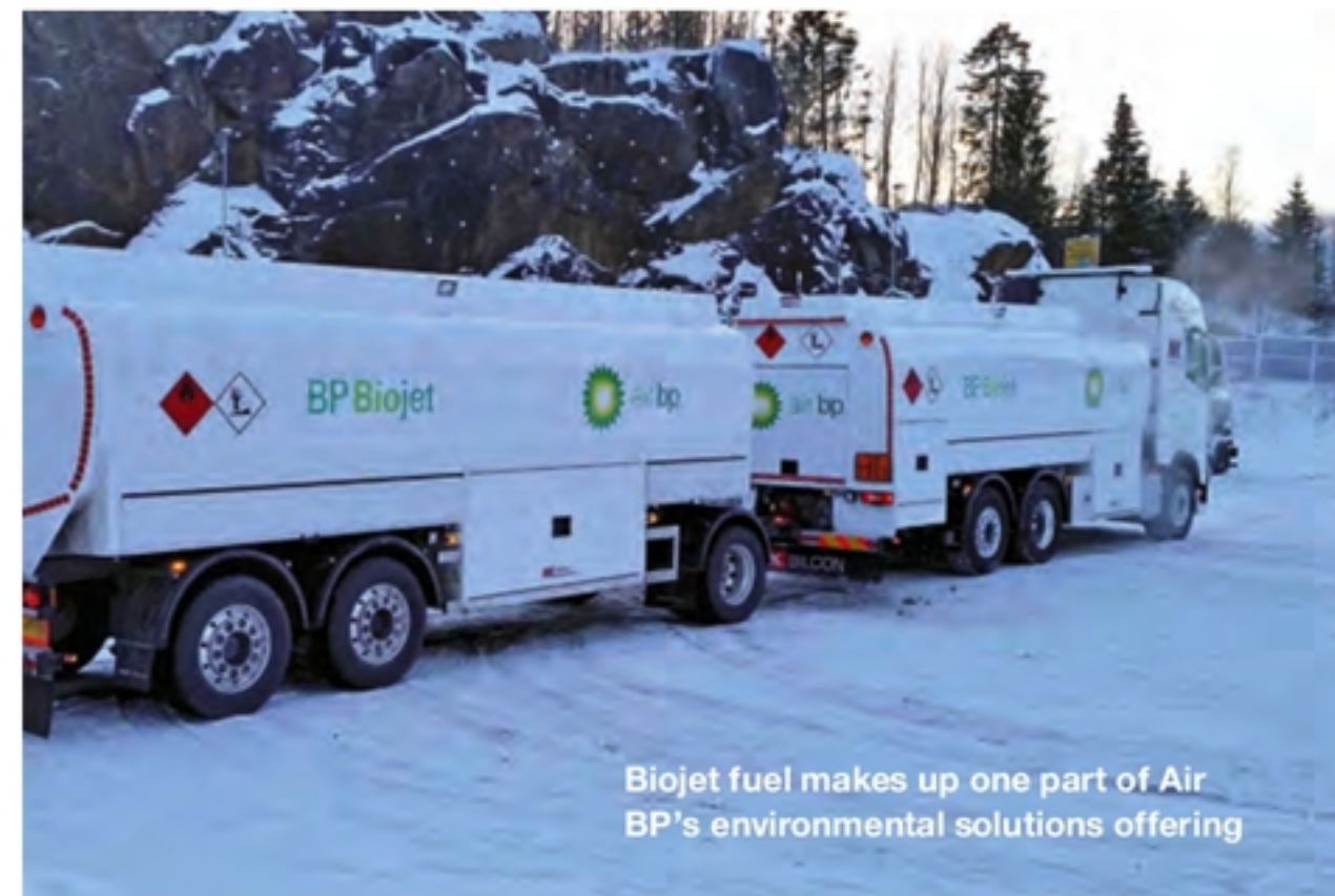
Biojet fuel makes up one part of Air BP's environmental solutions offering

The pathways for the French fuel supplier are sugar-to-biojet (in partnership with US company Amyris); hydro-processed esters and fatty acids-to-biojet; and alcohol-to-biojet (in partnership with developer Gevo), and TOTAL – an ASTM approved company – has already begun commercial