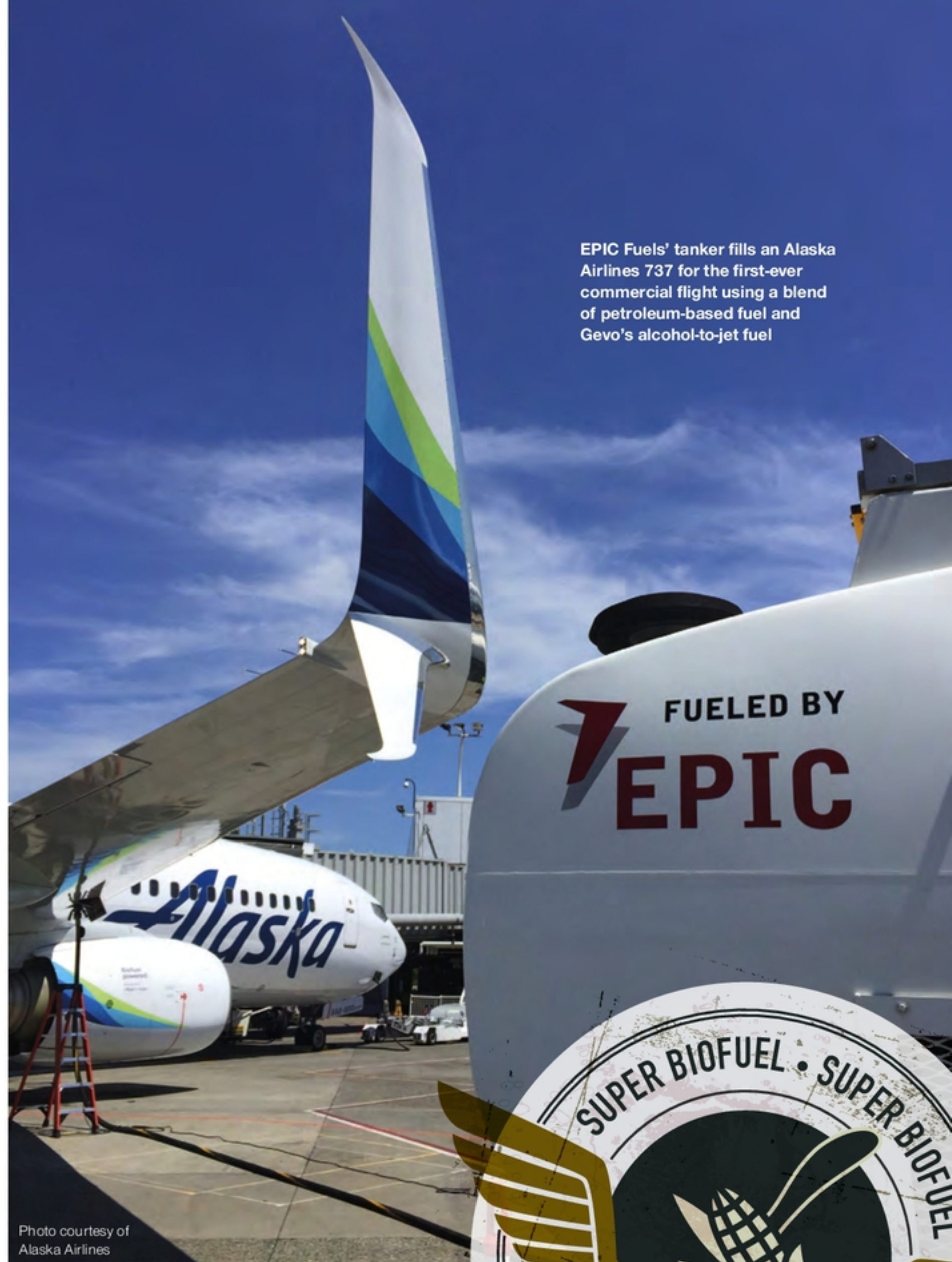
EPIC Fuels' tanker fills an Alaska Airlines 737 for the first-ever commercial flight using a blend of petroleum-based fuel and Gevo's alcohol-to-jet fuel

For Marchand, the mainstream use of biojet is still a way off – he predicts it will not happen within the next 10 years – but its popularity will continue to grow in line with GAMA and IBAC's 2020 target for carbon emissions. ○