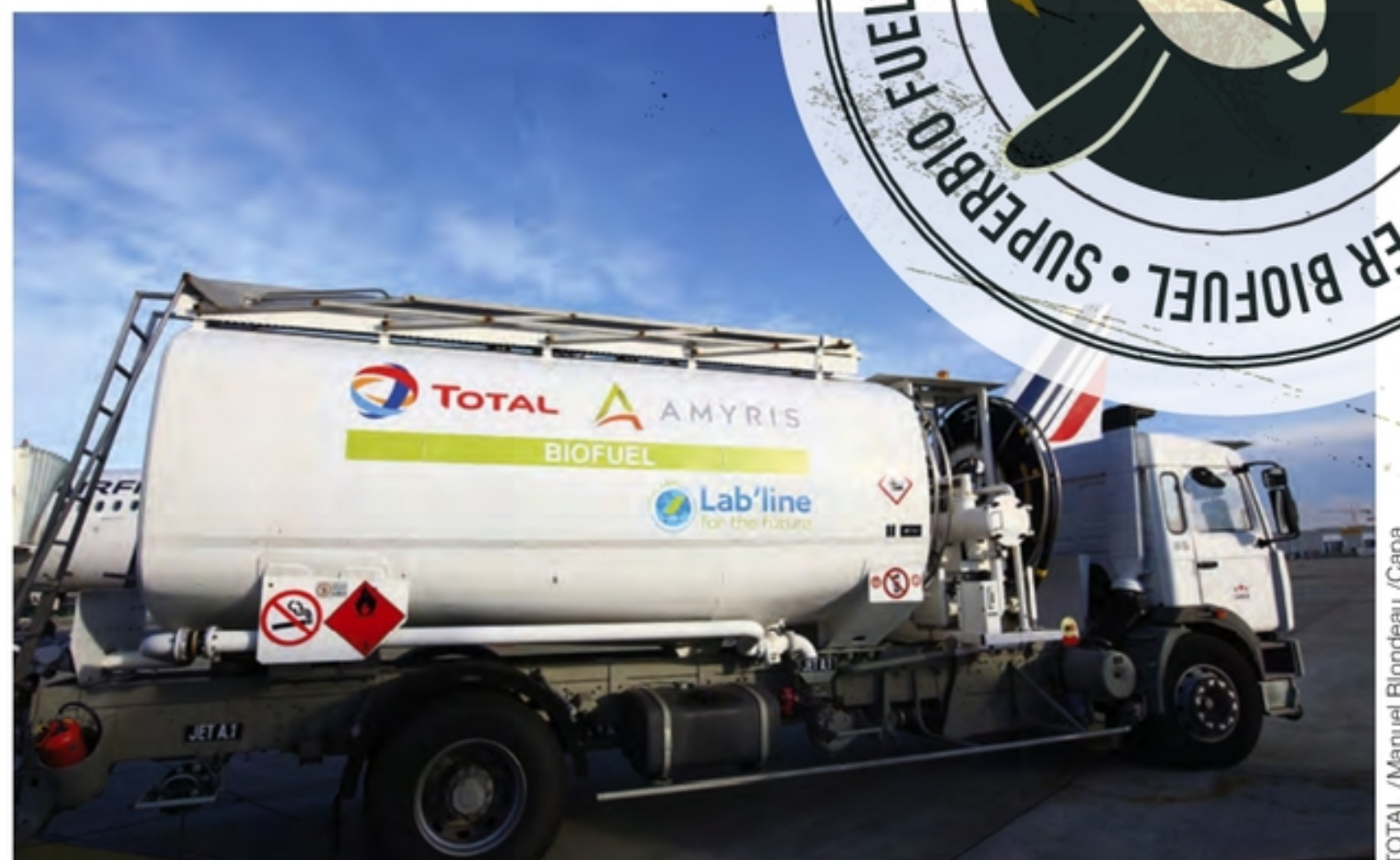
TOTAL developed a biojet fuel with Amyris for its Lab'Line for the Future project